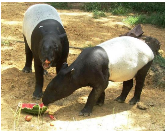
Young Male Tapir Leaves Jackson

The Jackson Zoo currently houses the following SSP animals: Fishing Cat, Chimpanzee, Black & White Colobus, Wattled Crane, White Naped Crane, Addra Gazelle, White Handed Gibbon, Diana Guenon, Pygmy Hippo, Red Ruffed Lemur, Amur Leopard, Lion Tail Macaque, Golden Bellied Monkey, Brown Handed Spider Monkey, Schmidt's Monkey, Red Fronted Lemur, Orangutan, Red Panda, White Rhino, Cotton Top Tamarin, Malayan Tapir, Sumatran Tiger, Red Wolf and Grevy's Zebra.