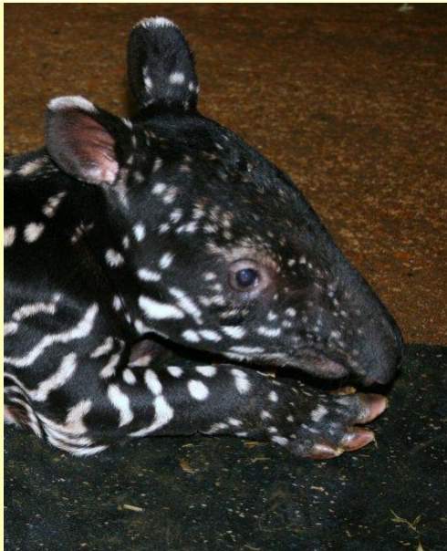
Baby Male Malayan Tapir Born May 26, 'name the baby tapir contest' in progress!