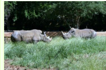
Ronnie (left), our new male white rhino meets his new mate.

A male white rhino was transferred from White Oak Plantation in Florida and joined our female recently in their new lush habitat. It took them a while to get used to each other but have now adjusted nicely.