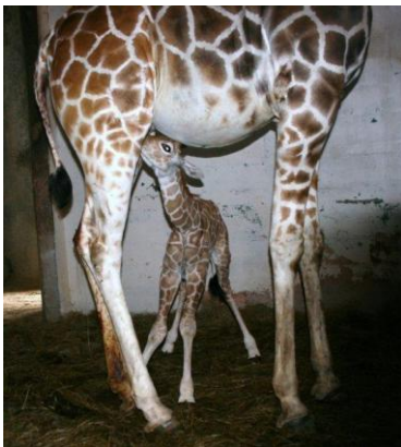
Baby 1 day old nursing

The calf stands approximately 5'8" and was born with a weight greater than 120 pounds. This is the 2nd calf for parents, Diamond (mom) and Casper (dad) but 7th calf for Diamond.